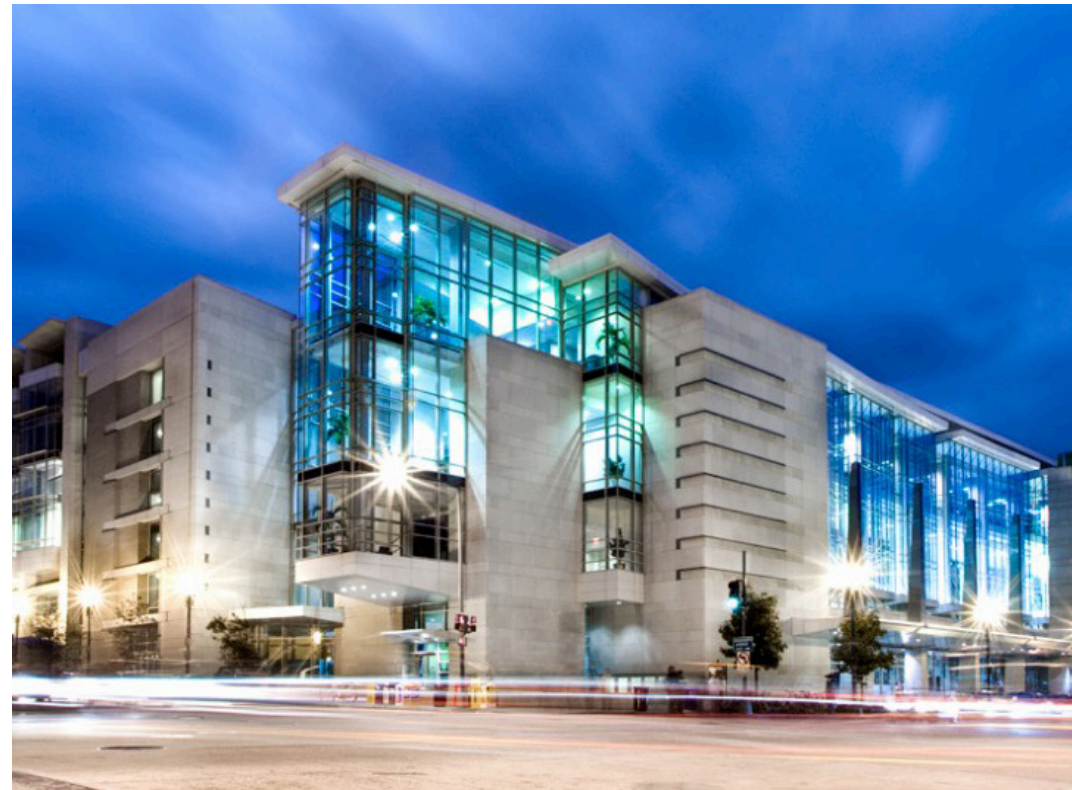
WALTER E. WASHINGTON CONVENTION CENTER